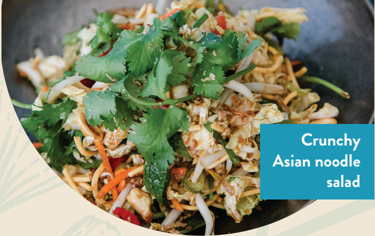
Crunchy Asian noodle salad