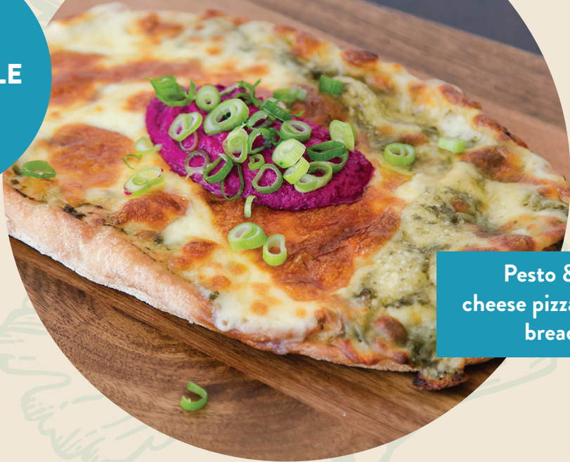
Pesto & cheese pizza bread